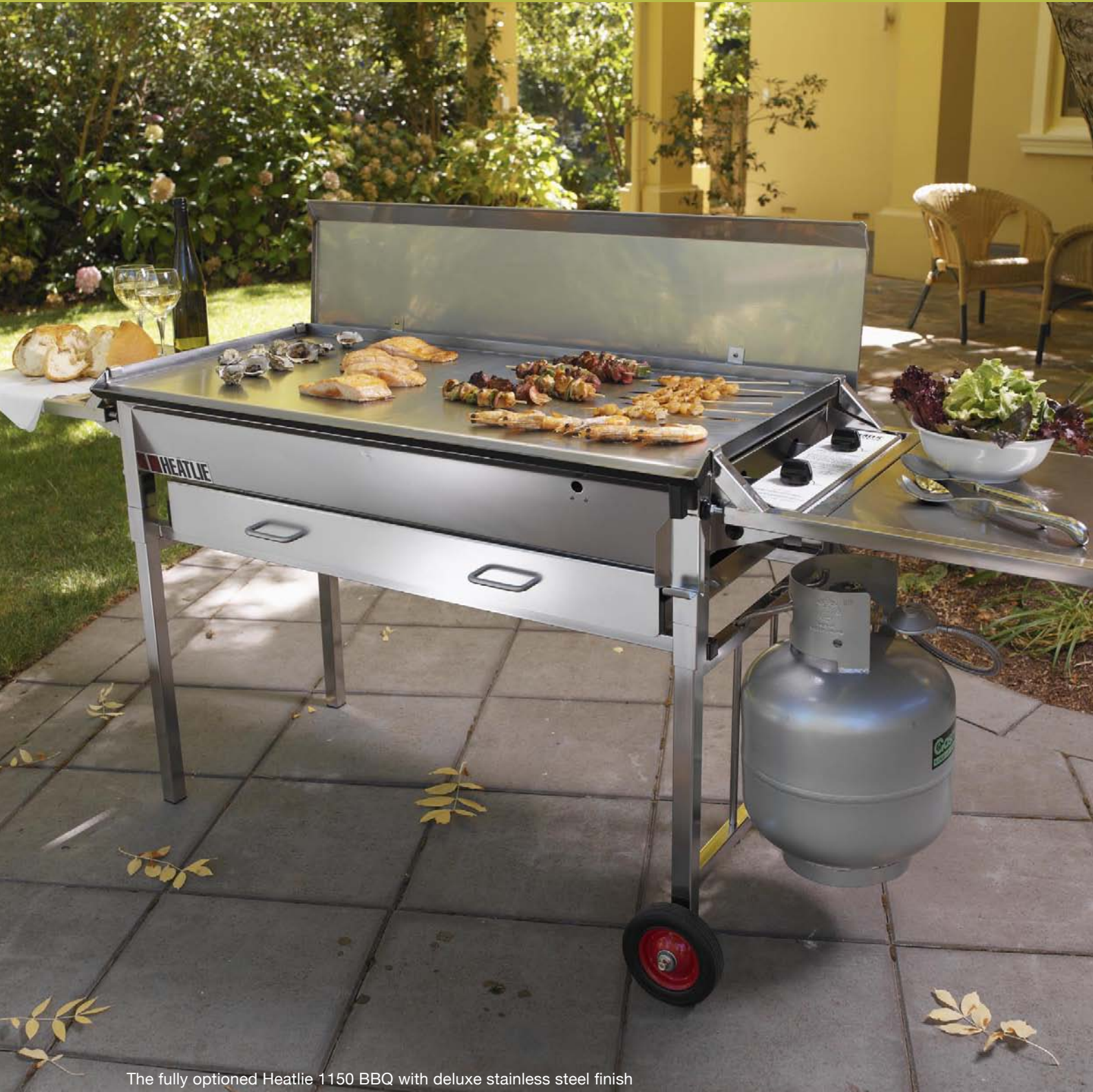
The fully optioned Heatlie 1150 BBQ with deluxe stainless steel finish