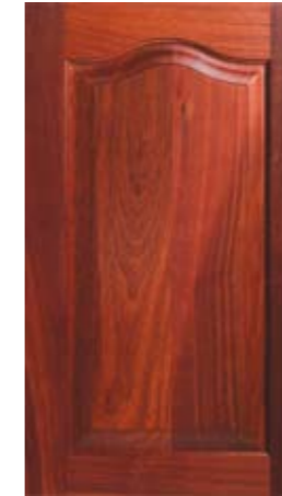
Design: Arch Rail: Standard Panel: Raised Solid Jarrah