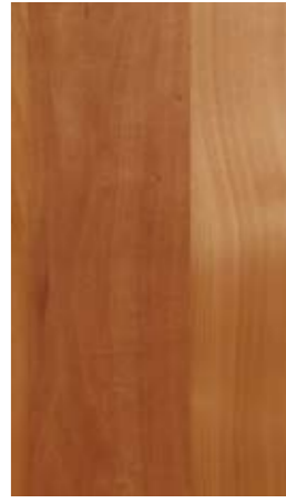
Design: Veneer Door Rail: N/A Panel: N/A Southern Myrtle