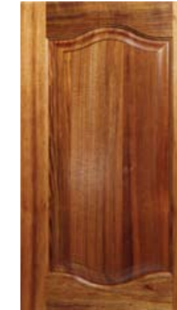
Design: Double Arch Rail: Standard Panel: Raised Solid Tasmanian Blackwood