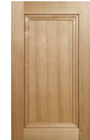
Design: Square Rail: Victorian Panel: Flat Panel Veneer Tasmanian Oak