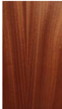
Design: Veneer Door Rail: N/A Panel: N/A Sapele