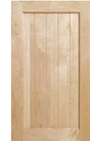
Design: Square Rail: Standard Panel: 'V' Groove Solid Canadian Rock Maple