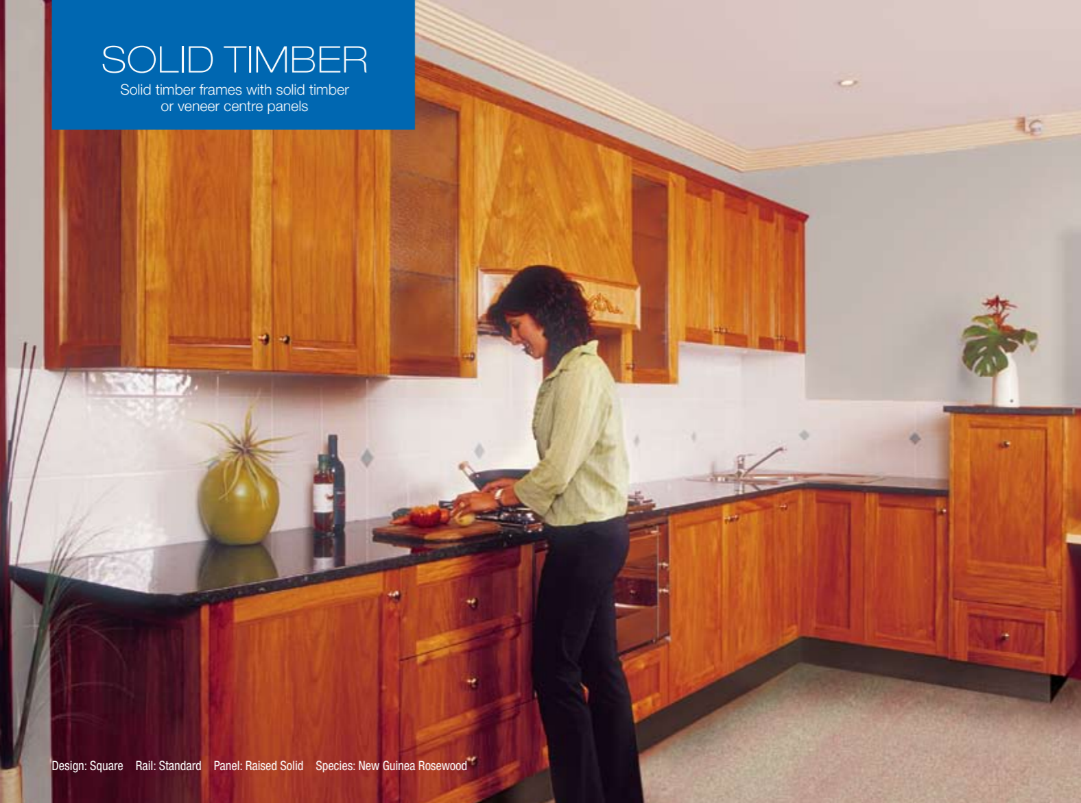
Design: Square Rail: Standard Panel: Raised Solid Species: New Guinea Rosewood

Solid timber frames with solid timber or veneer centre panels