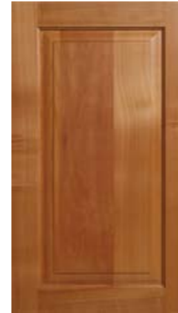
Design: Square Rail: Standard Panel: Raised Solid Southern Myrtle