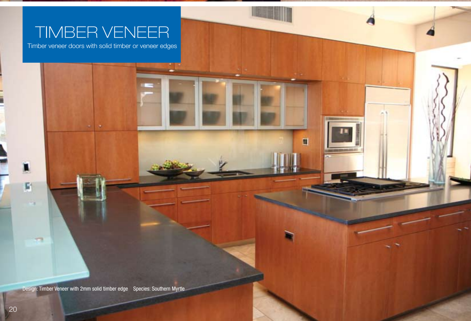
Design: Timber Veneer with 2mm solid timber edge Species: Southern Myrtle

Timber veneer doors with solid timber or veneer edges