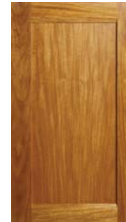
Design: Square Rail: Bevel Panel: Flat Panel Veneer New Guinea Rosewood