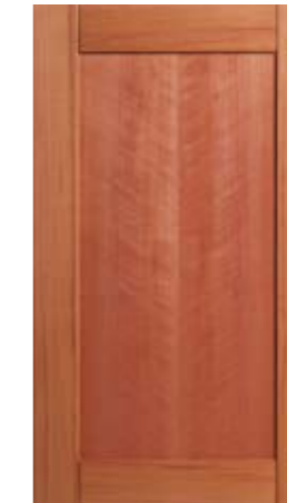
Design: Square Rail: Shaker Panel: Flat Panel Veneer Southern Myrtle